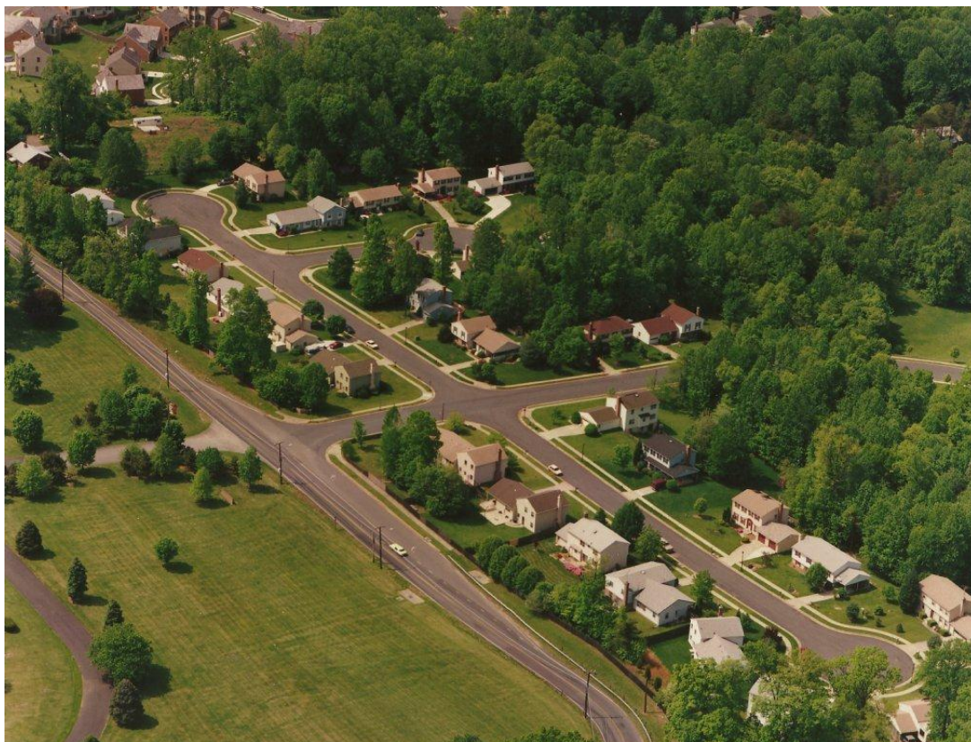
Spring 1992 aerial view of cemetery, Cotton Farm, Harvester Farm, and Tumbleweed.