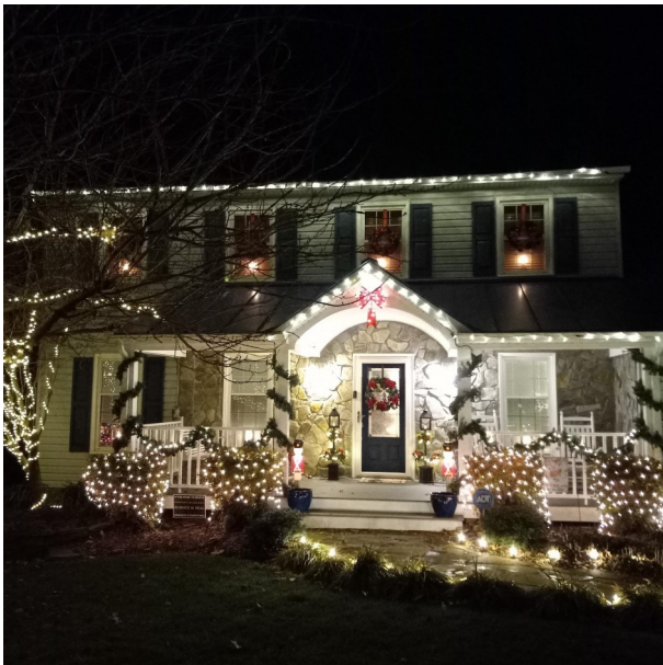
Most Classic—4358 Harvester Farm Lane