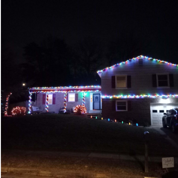
Most Colorful—4357 Harvester Farm Lane