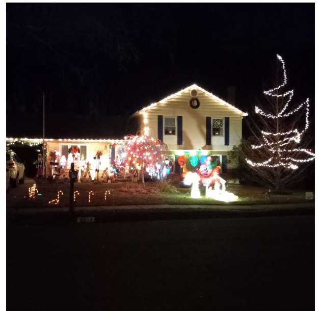
Holiday Heavyweight—9998 Cotton Farm Road