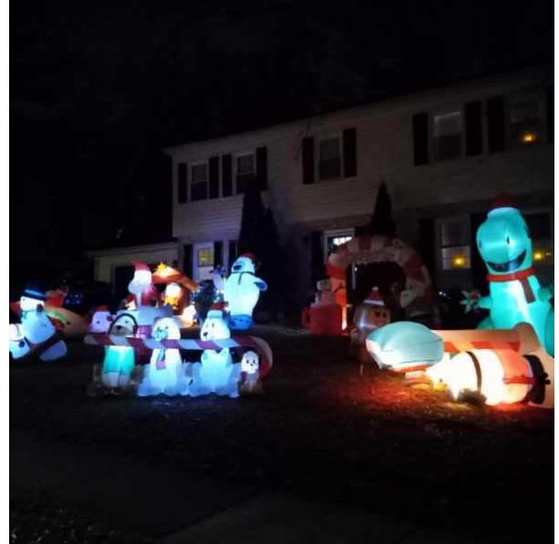
Most Holiday Spirit—4285 Country Squire Lane