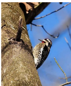
Yellow-bellied Sapsucker pecking at a tree at Yazoo NWR

The new year's daily backyard bird census got off to a great start with 18 birds logged on 1 January. The first species was Northern Cardinal, which was also #1 in 2020. First day highlights were a solitary female Purple Finch, Brown Creeper, and Cooper's Hawk. On subsequent days, we welcomed Eastern Bluebird, Eastern Towhee, Hermit Thrush, Red-winged Blackbird (male and female), and Brown-headed Cowbird (male). At the time I submitted this article, our backyard species count for the year stood at 31 , which ties 2019 as our third-highest January count and falls just short of 2022 (33) and 2023 (32). Our daily average to date is 20 species. On three days in January, we saw five woodpecker species (what we term the "grand slam"). The sixth possible woodpecker, Yellow-bellied Sapsucker, has yet to make an appearance, but it's only a matter of time.